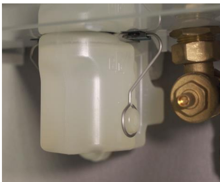
Figure 2 New Retaining Clip