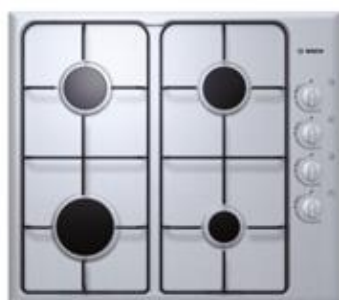
NGU4151DB - Bosch FD 8901 - 9110