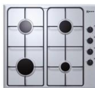
T20S31N0 - Neff FD 8901 - 9110

BSH Home Appliance Ltd (BSH) has initiated this precautionary measure as, during comprehensive product monitoring and detailed research, BSH identified a potential issue regarding the gas connectors. In particular circumstances the gas connector can crack or break, which could result in an escape of gas.