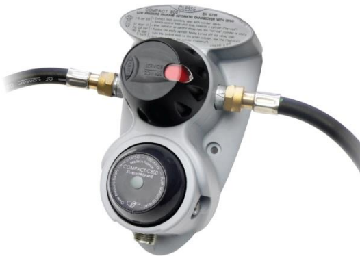
Figure 1. Compact 800 Valve assembly